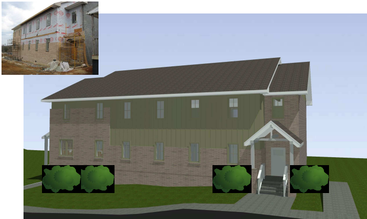
ARBOR HOUSE 1351 NORTH MAIN STREET